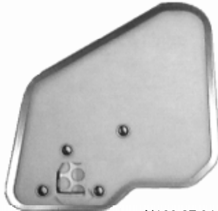
N160 27 04 Fabric both sides