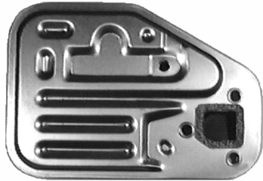
N160 27 07 Steel side showing - underside is plastic