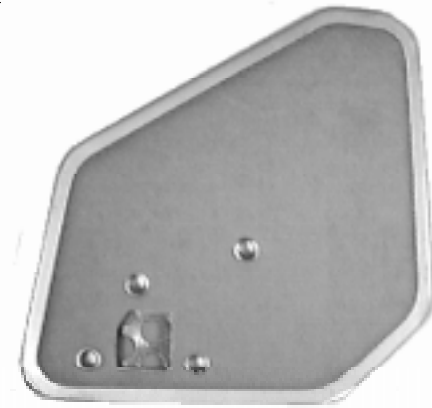
N160 27 02 Fabric both sides