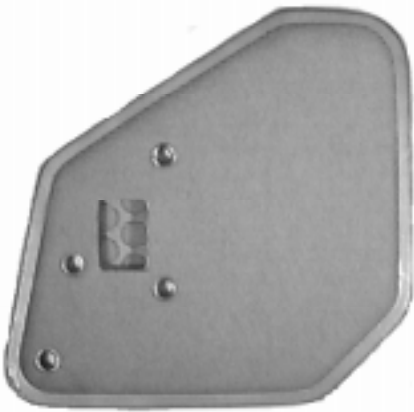
N160 27 01 Fabric both sides