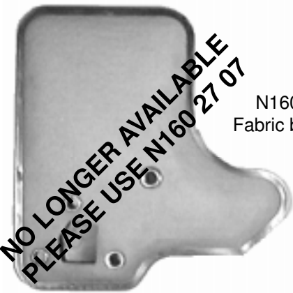
N160 27 03 Fabric both sides